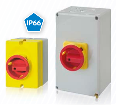
Switches from 3P up to 8P or changeovers. Modular switch in plastic enclosure (sealable). Padlockable handles.